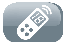
Remote control with LCD-display