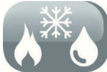
3 functions in 1